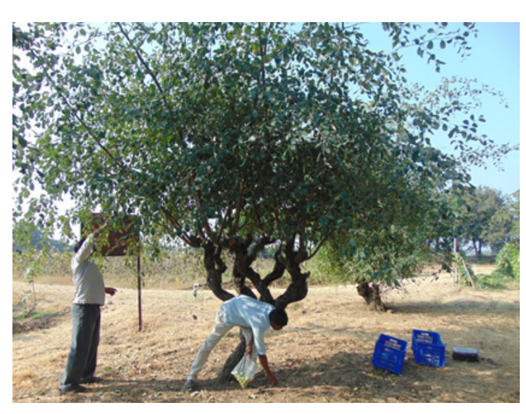
Fig 2. Harvesting ber fruits