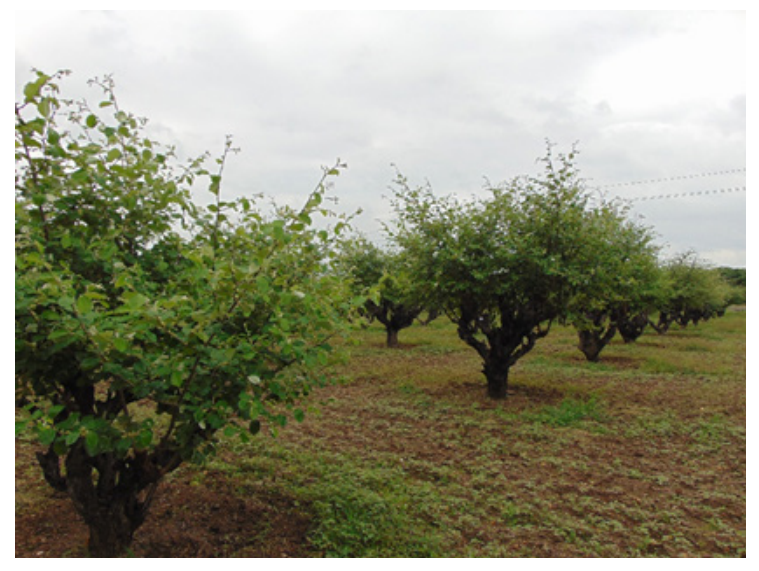
Fig 1. Ber crop after pruning

Fruits must be harvested at the proper stage of maturity in order to maintain their ideal organoleptic quality and prolong their shelf life. When the fruits reach maturity, different varieties will have greenish yellow to golden yellow colors, while the young fruits will remain green in color. The optimal measure for assessing CV Umran's maturity is slightly lower than one with golden yellow skin. Fruits that are either young or too mature have little market value. Overripe fruit loses its natural color and texture—it becomes crisp and juicy—while immature fruits taste caustic and lack the appropriate sweetness. These fruits have a slimy feel and turn red or dark brown in color.